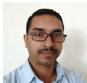
By: M.R. Lahu

Religions across the globe have always been seen from two fronts. The first is to see them as principles codified for people by a divine will and therefore, not to be questioned. The second one is to view them as manmade caricatures of God or principles forcefully stamped on people by people. This view demands the need of a scientific analysis, questioning the authenticity of all the religious beliefs. Both the views are gaining momentum and of course, the first one has a mammoth fan following with a large part of the world kneeling for the divine interventions in human progress. Religions, successfully manipulating their belief systems could bring about demographic changes across the globe. The influence that most of the religions could successfully embed over all over the world was the result of their aggression and indecorous invasion and contemptuous intellectual involvement. History may not often reveal the true story of persecution that most of the religions could spread their wings with. It is the second kind of view that brought creative changes in the thinking pattern of people. Those who remained imprisoned in the contrariness of principles concocted by religions proposed changes suitably matching the demand of the time. Most of the religions underwent this change time and again. Call them a creative minority at least for their intellectual rebellion, questioning the authenticity of the patriarchal hegemony in most of the religions. Coming out of the dungeons